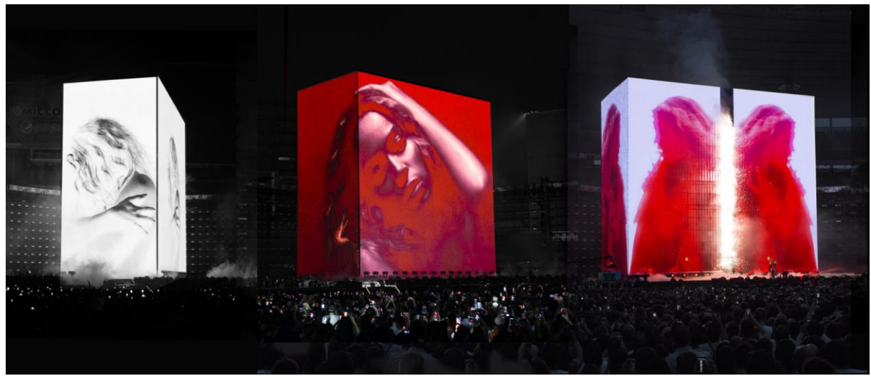
Es Devlin: Beyoncé Formation Tour 2016